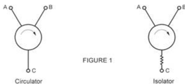
Figure 1 shows the schematics for a circulator and an isolator. Notice how an isolator is a circulator with the third port terminated. The arrows represent the direction of the magnetic fields and the signal when applied to any port of these devices. Example: If a signal is placed at port A, and port B is well matched, the signal will exit at port B with very little loss (typically 0.4dB). If there is a mismatch at port B, the reflected signal from port B will be directed to port C.

To understand how these components control the signal flow, think of a cup of water into which you place a spoon and stir in a clockwise motion. If you sprinkle some pepper into the cup and continue to stir, you will notice that the pepper easily follows the circular motion of the water. You can also see that it would be impossible for the pepper to move in a counterclockwise direction because the water motion is just too strong. The interaction of the magnetic field to the ferrite material inside isolators and circulators create magnetic fields similar to the water flow in the cup. The rotary field is very strong and will cause any RF/microwave signal placed at one port to follow the magnetic flow to the adjacent port and not in the opposite direction.